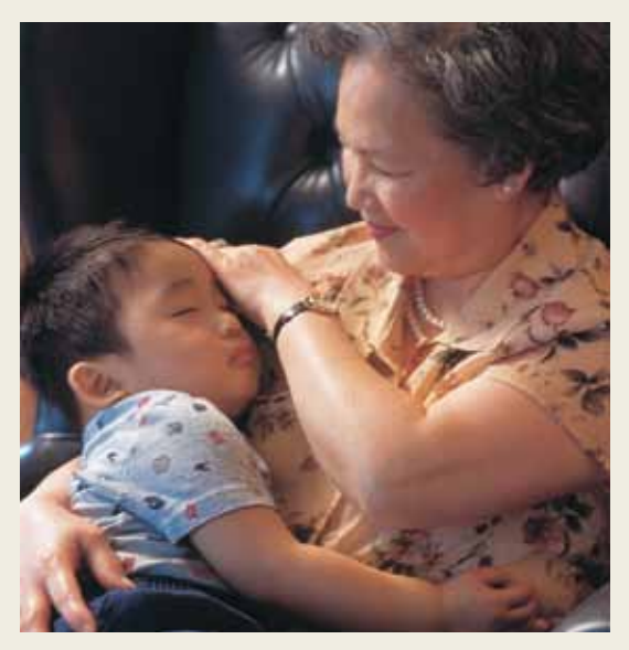
As adults, we have the power to protect our children from the dangers of secondhand smoke.