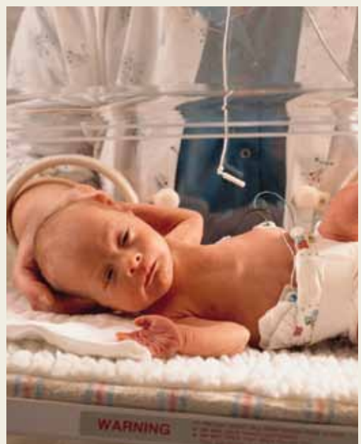
Smoking during pregnancy can cause your baby to be born too early and have low birth weight. If you smoke, your baby is more likely to become sick or die.